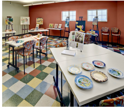
Highview Hills Art Studio